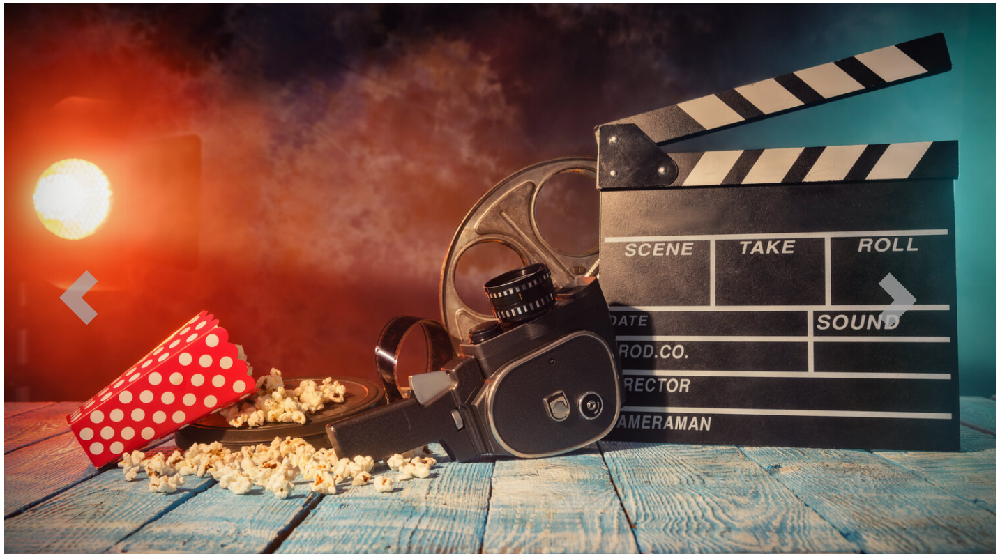
( https://gamma.creativecirclecdn.com/mmc/original/20260306-154209-09a-SCREEN-FilmFestival-260306-1.jpeg )